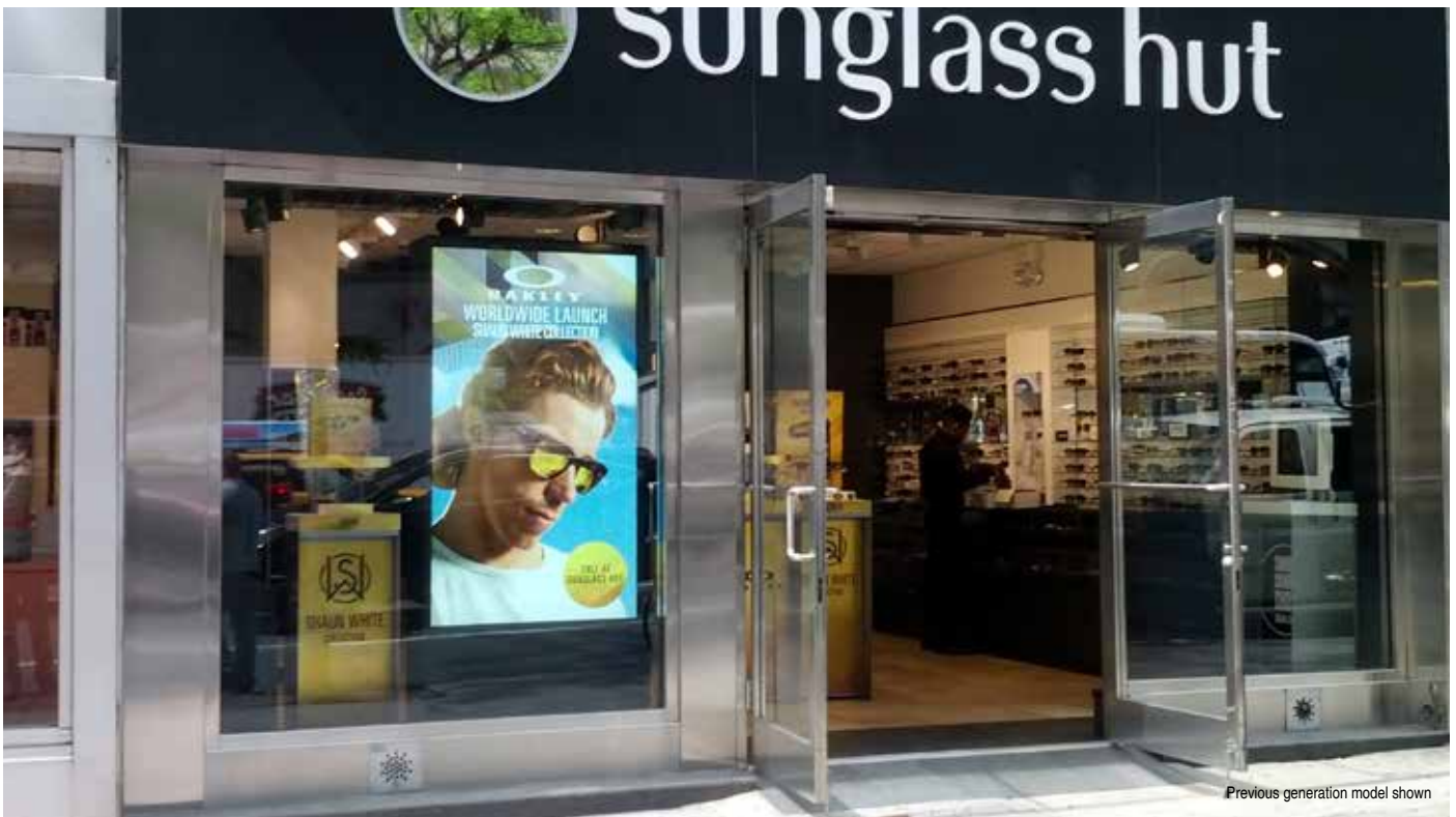
Previous generation model shown